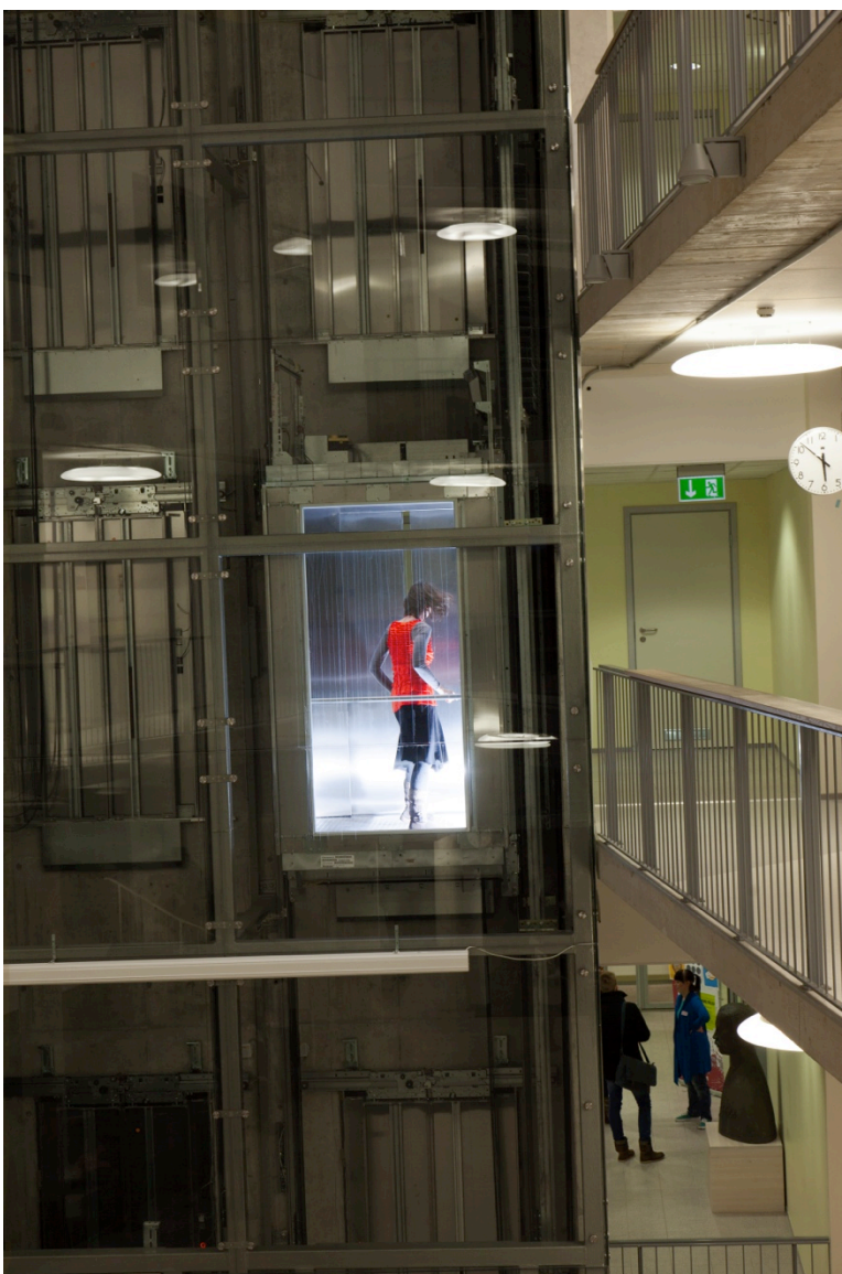
Artistic Research in the Astra Building Estonia

A theatre or concert hall with its traditional arrangement of seats and stage, set up an expectation of performers and audience behaving in a certain way; in site specific work spontaneity is in the nature of the beast, we simply have to accommodate the possibility of something unexpected happening as a result of the site. This could happen with light, architecture, people, sound or movement, so if the aesthetic and compositional structure is designed to accommodate that, then each and every performance is significantly different, which keeps the work fresh and energetic which is what I find fascinating.