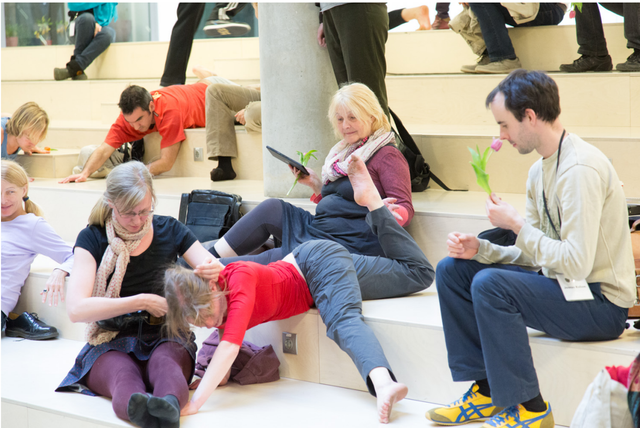
Sighted audience and Visually Impaired Dance Artists Interact