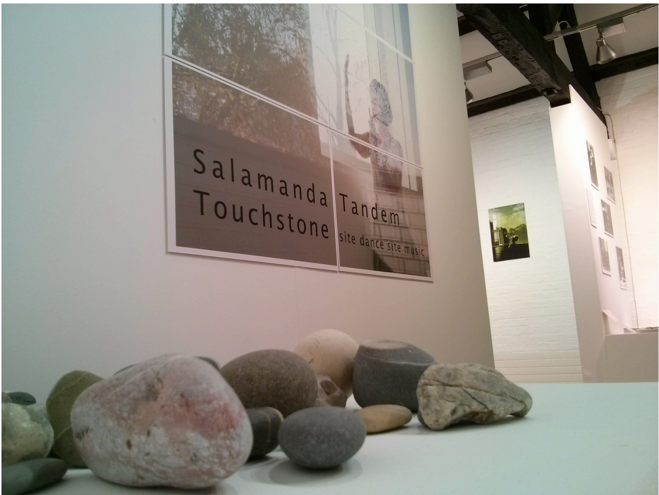
Salamanda Tandem Celebrating 25 year's Exhibition at Rufford Gallery