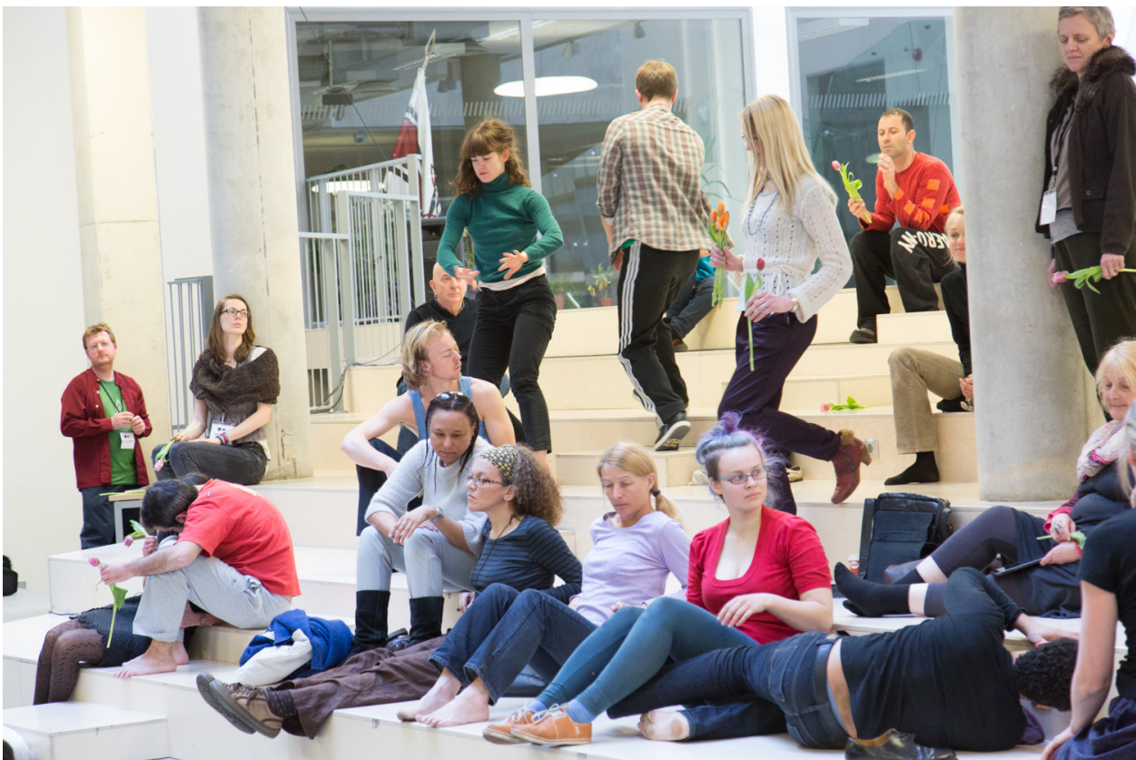
Symposium Delegates and visually impaired performers interact