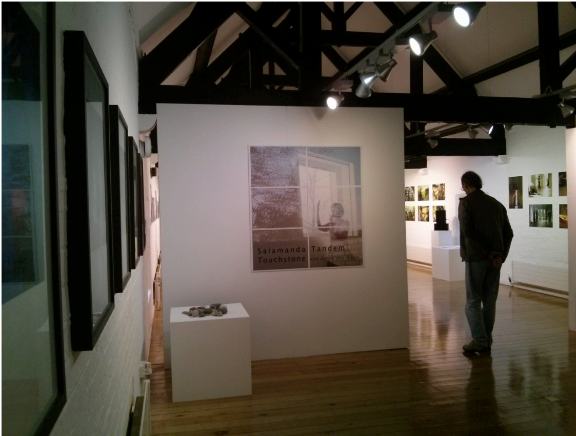
Rufford Gallery Touchstone Exhibition September 2013

A sensory exhibition of New Film, Photographs, dance, sound and music