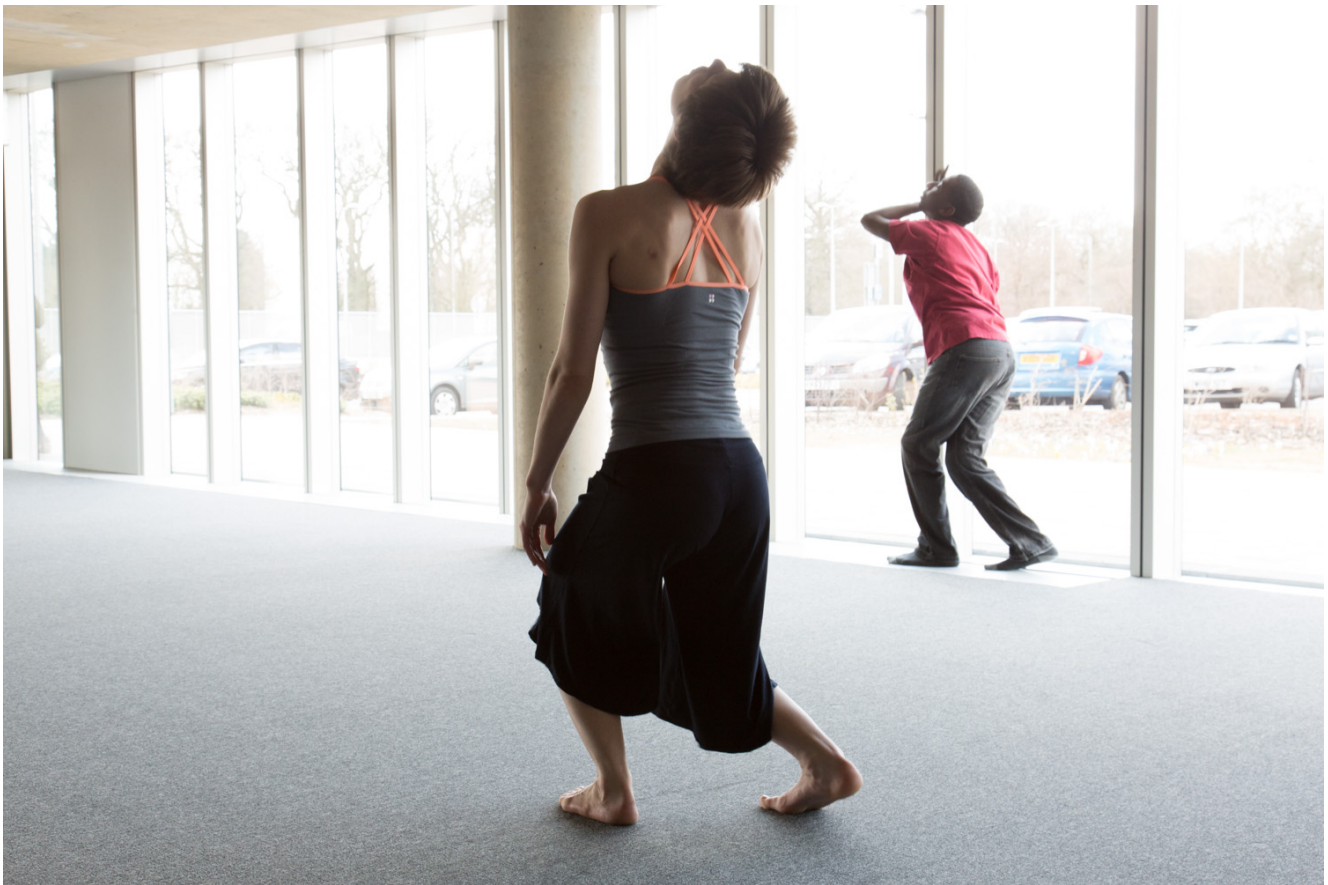
2 Visually Impaired dancers explore through sensing the air

Each building offers different potentials, and it takes time to realize what these are.