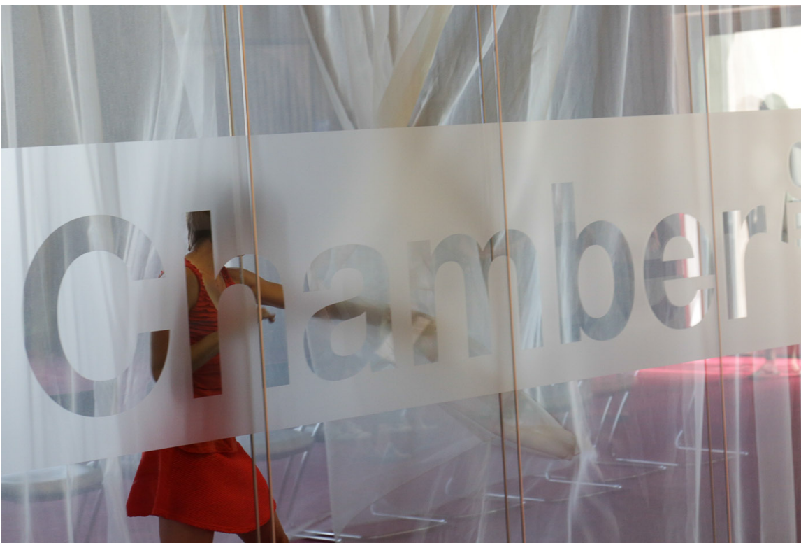
Dancers Indra Slavina Featured here in the council chamber

‘Watching the dancer move through The Core and listening to commentary/soundscape through headphones made me look at a building I know well in a very different light. It was also interesting to hear the soundman talk about the different resonances from each floor tile (too subtle for me!) as the dancer’s stick moved across them.’